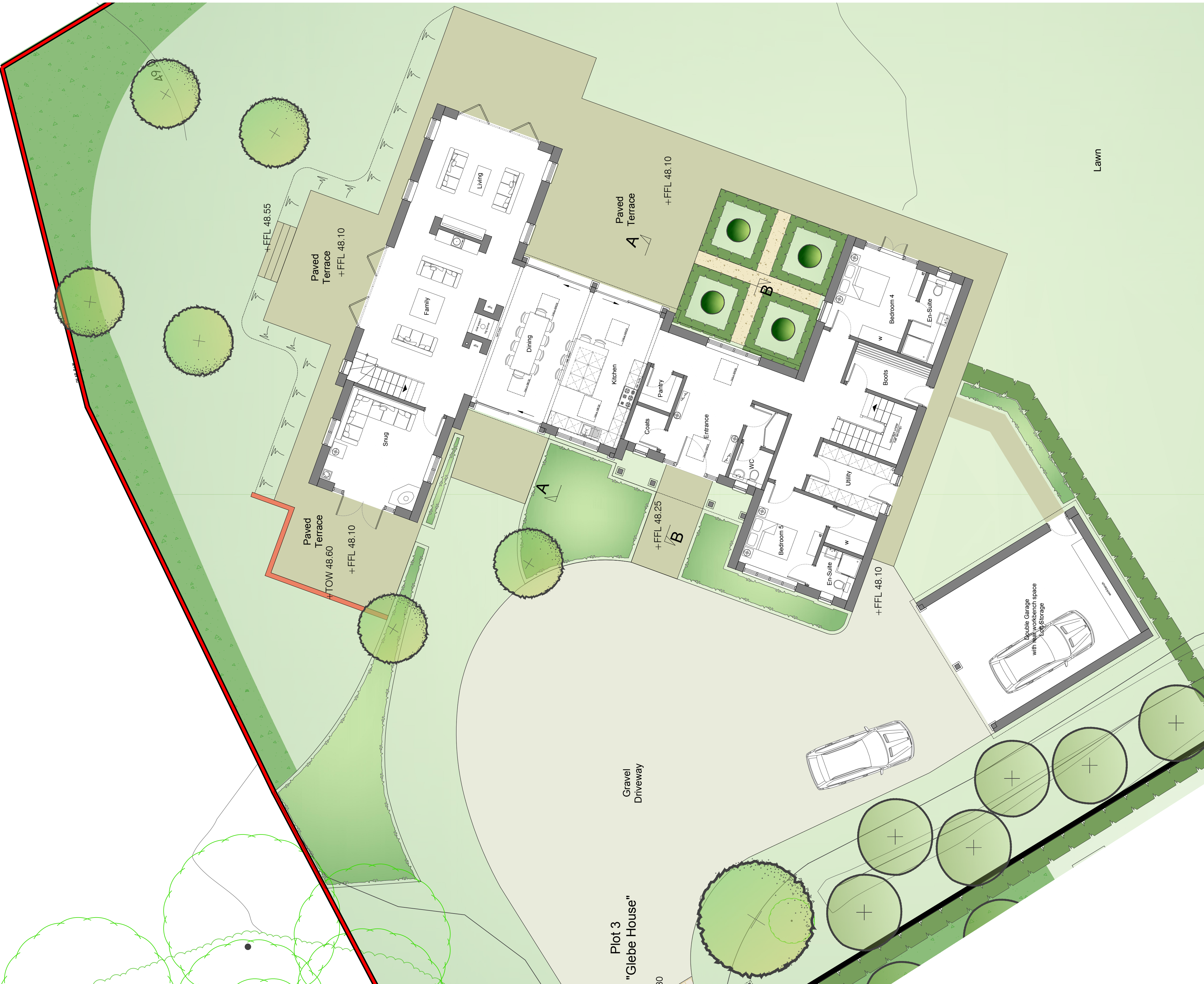
Plot 3 Ground Floor Plan 1:100

The drawing is to be used in conjunction with drawings and reports from: Indigo Landscape Architects: 10465-2022-12-01 Supplemental Landscape Information: 10465-2022-12-12