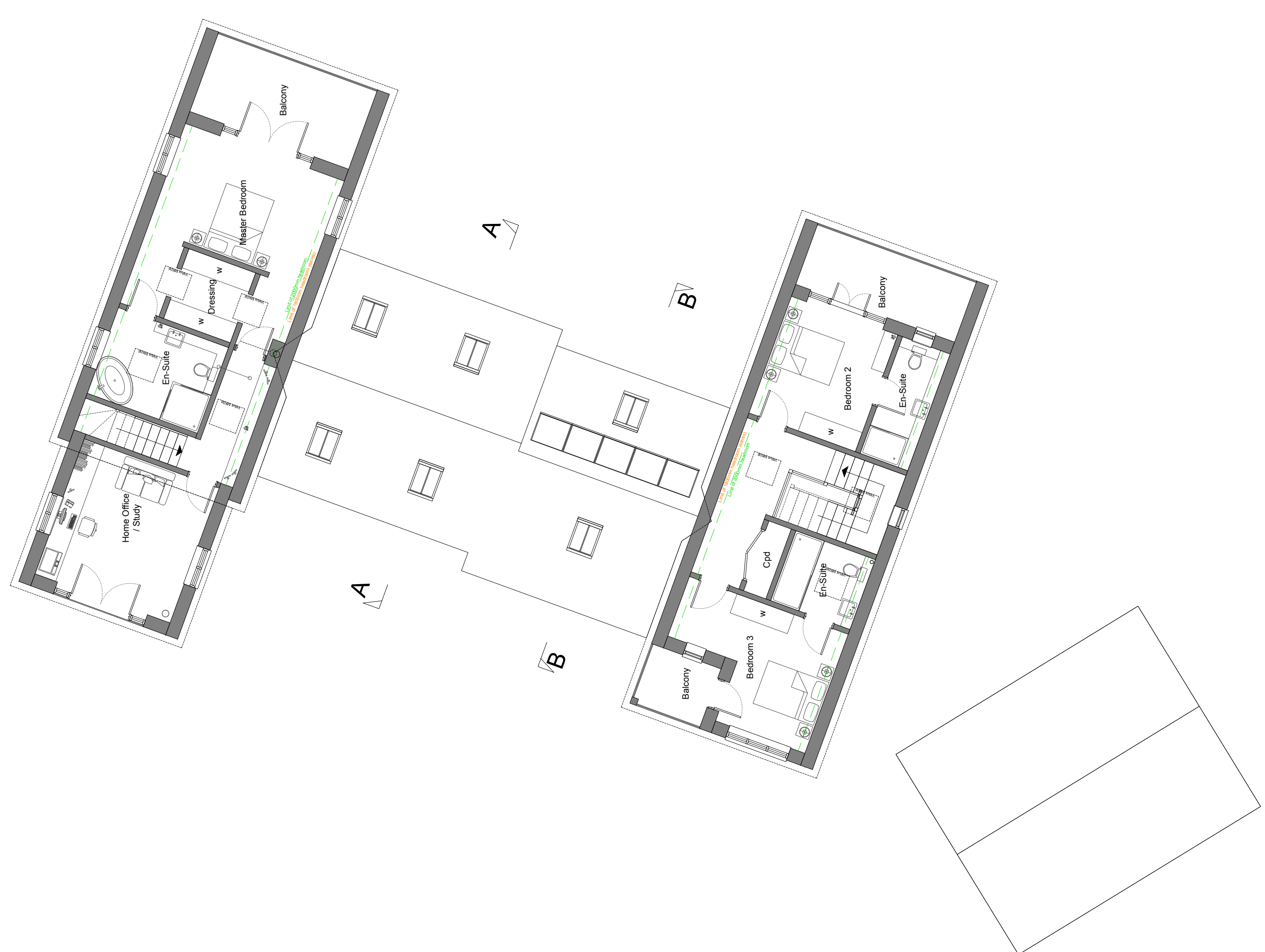
Plot 3 First Floor Plan 1:100